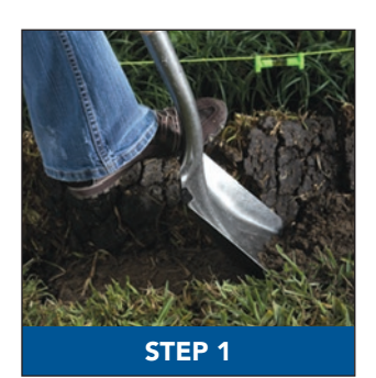
STEP 1: Site Preparation and Excavation Stake out the area where the wall will be installed. Dig a trench 16" wide and 10" deep.