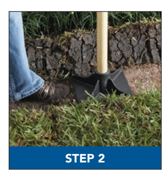
STEP 2: Base Preparation Add 6" of paver base and tamp in trench to create a rigid and level surface.