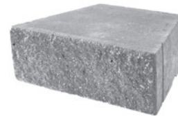
#822 - Straight Unit

Before specifying a specific product, please confirm availability with your local Keystone Hardscapes producer.