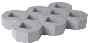
Grasstone II 80mm

Grasstone, made with an open-void, interlocking lattice design creates a flat surface for intermittent paving applications. The open void allows for on-site infiltration of stormwater or revegetation.