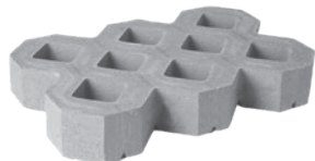
Grasstone II 100mm